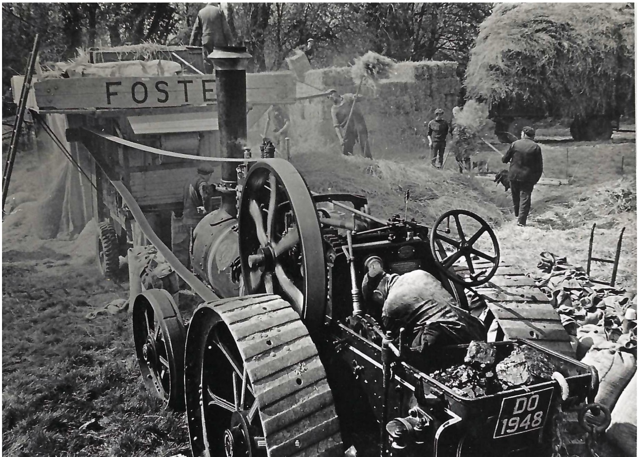
Baling & stacking hay with the help of a traction engine