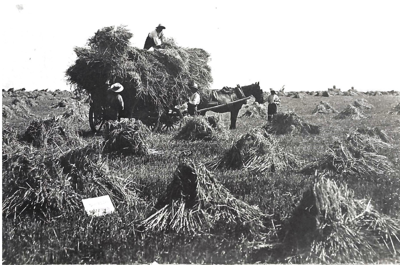
Loading a wagon with sheaves c 1900