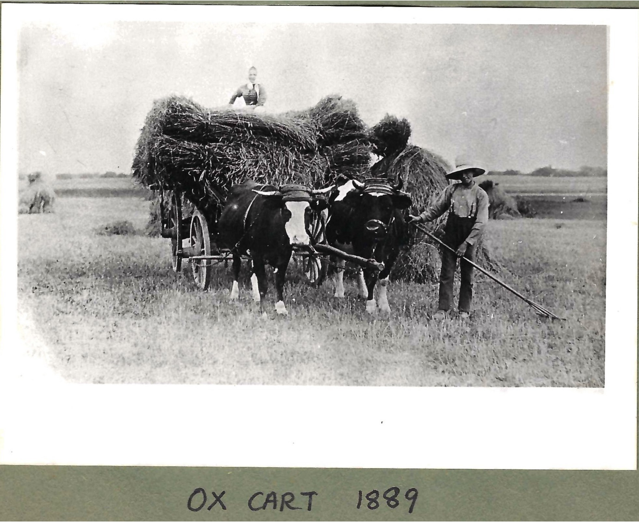
Loading a wagon with sheaves