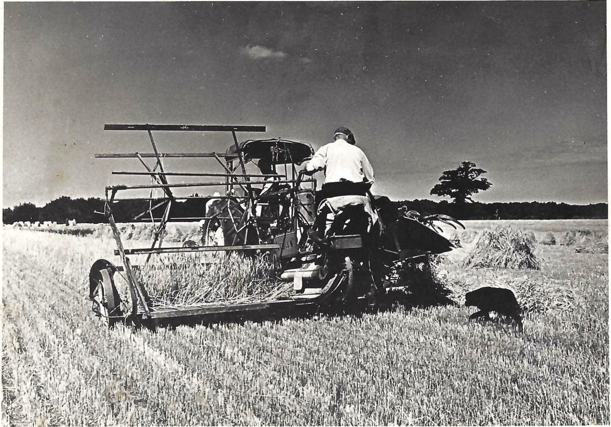
HARVESTING BARLEY WITH BINDER 1969