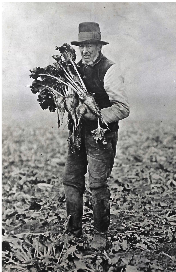
SUGAR BEET sugar beet INTRODUCER 1912