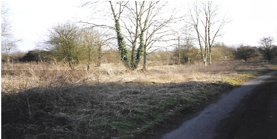
Modern view of Whitwell Common – 2002